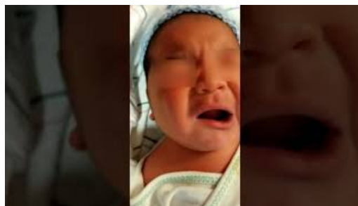
VIDEO 1: Facial Asymmetry with Crying

Parfianowicz et al. This is an open access article distributed under the terms of the Creative Commons Attribution License CC-BY 4.0., which permits unrestricted use, distribution, and reproduction in any medium, provided the original author and source are credited.