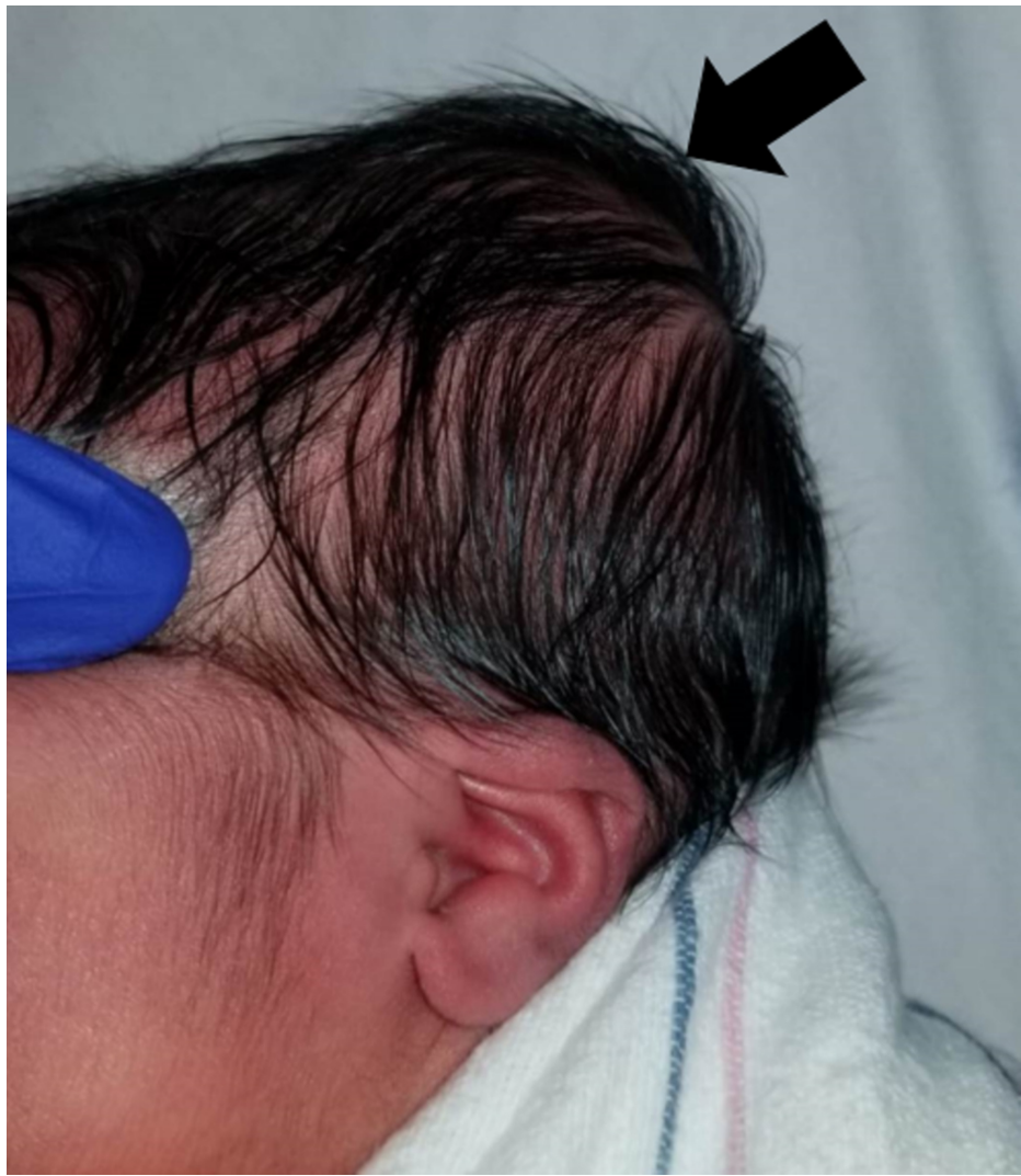
FIGURE 2: Left Posterior Cranial Swelling

Photograph taken during evaluation at 28 hours since birth showing a well-demarcated swelling in the left posterior parietal/occipital region.