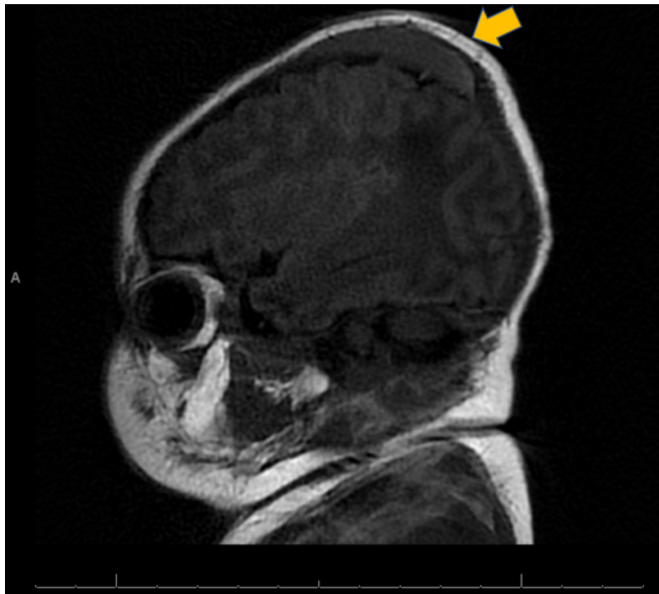
FIGURE 4: Non-contrast MRI: Left Sagittal View

A non-contrast MRI in coronal view showing the presence of a cephalohematoma with no intracranial lesion identified.