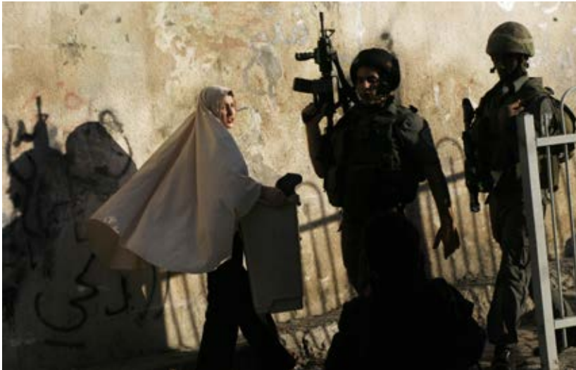
← A Palestinian woman walks past Israeli border policemen during the demolition of a Palestinian house by Jerusalem municipality workers in the Silwan neighbourhood of occupied East Jerusalem, on 5 November 2008

Jewish settlements, houses and compounds in the heart of Palestinian neighbourhoods have a disastrous impact not only on the displaced Palestinian families, but also on the entire neighbourhood and daily life of the Palestinians. Settlers are usually armed, and their compounds are fenced and protected by private security companies, which leads to friction with the local Palestinians. In several cases, these tensions have led to violent confrontations that usually end with the arrest and injury of Palestinians, including children. The settlers' control over land and property in Silwan has also led to the fencing of these sites, blocking passages that served the local Palestinian population and disrupting their lives.