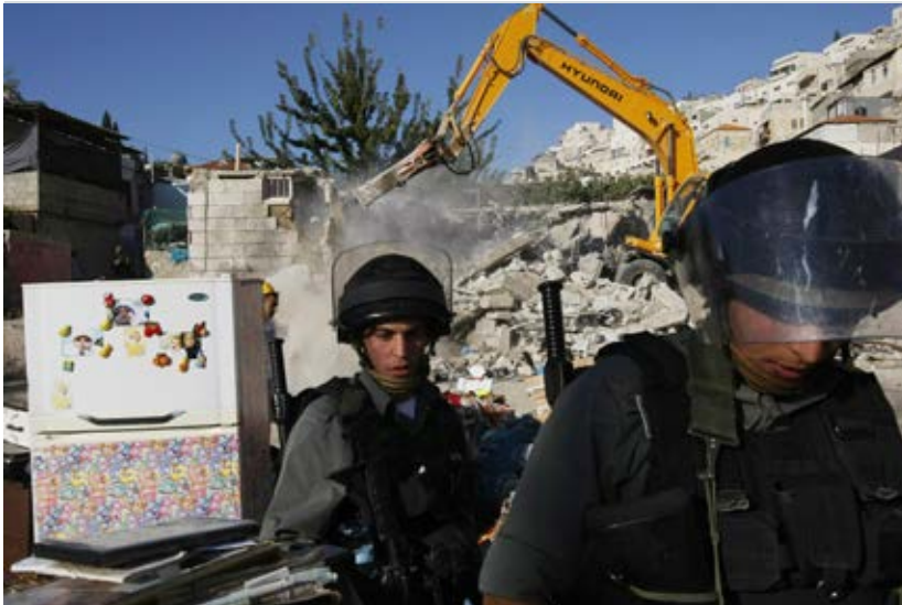
← Israeli policemen guard a bulldozer demolishing a house in the Silwan neighbourhood of occupied East Jerusalem, on 5 November 2008