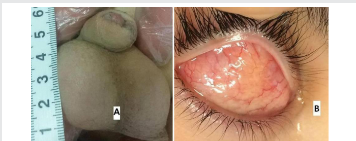
Figure 1: A: Photograph showing testicular enlargement. B: Photograph showing conjunctival hyperemia and yellowish nodules in the eye.

Laboratory examination revealed a white blood cell count of 5,350/mm 3 with a normal differential; a hemoglobin level of 13.2 g/dL; an erythrocyte sedimentation rate (ESR) of 71 mm/h (normal range: 3–13 mm/h); a C-reactive protein (CRP) level of 7.62 mg/dl (normal, < 0.8 mg/dl); follicle-stimulating hormone and luteinizing hormone levels of 0.23 and 0.1 mIU/mL,