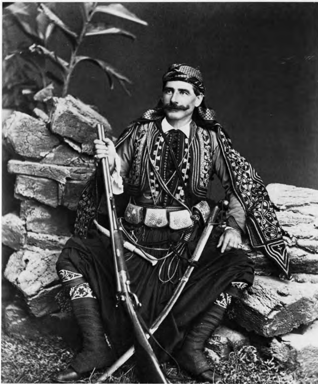
171. Dragoman Guide for Travelers. Collection of the Harvard Semitic Museum.