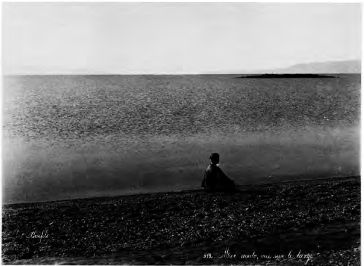
70. Dead Sea, View of the Expanse.