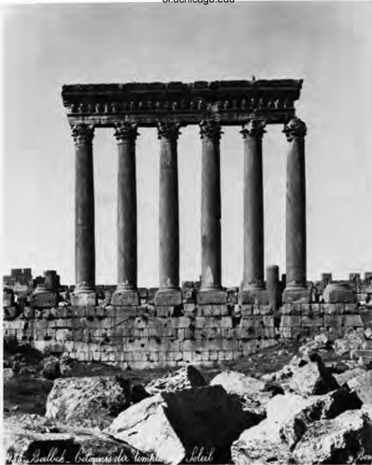
121. Baalbek. Columns of the Temple of the Sun. (Syria)