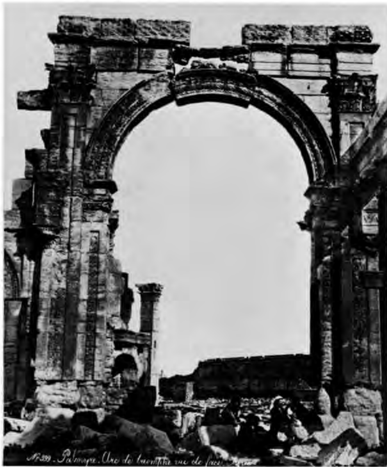
87. Palmyra. Arch of Triumph, Facade View (Syria).