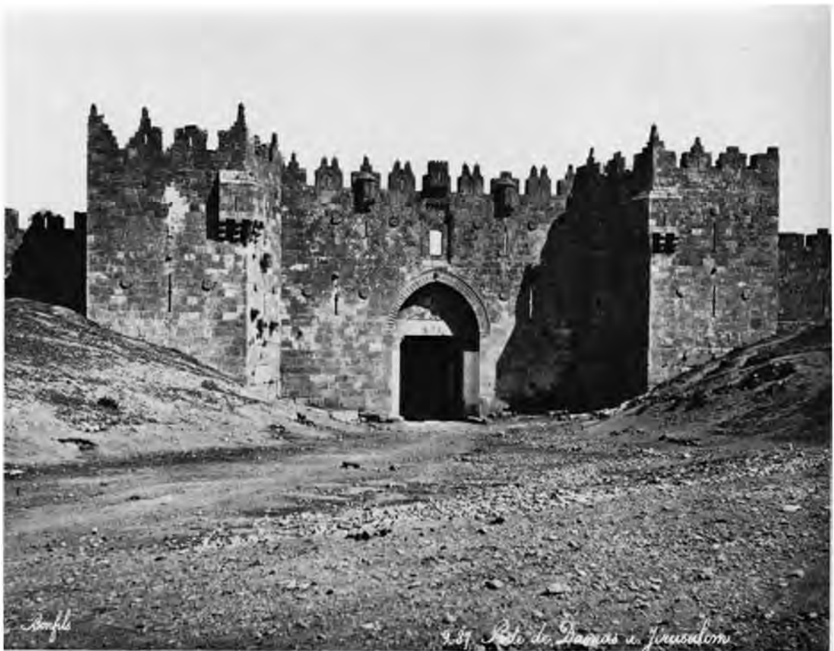
37. Damascus Gate, Jerusalem.

of the Romantic Orient made in the last century. They are picaresque since they are images of travel and souvenirs of distant locales meant to instruct and entertain. They are picturesque in that they depict the exotic as well as the natural in order to pictorially delight. Formal rules of composition are consciously adhered to but just as intentionally abandoned for often spectacular and exceptional visual insights that are remarkably modern. Conventions, such as the inclusion of the human figure as a scale referent and the internal signing of the author's name on or in the subject, are frequently played with in very self-conscious ways, infusing the image at times with an ironic tone virtually unique in 19th century photography.