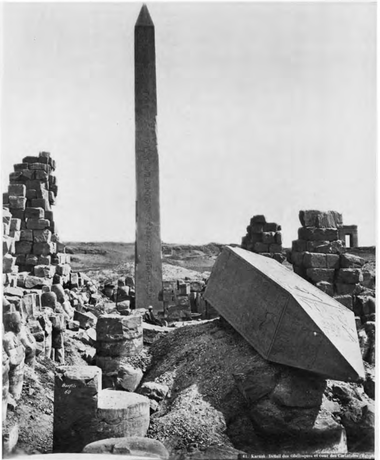
14. Karnak. Detail of the Obelisks and the Court of the Caryatides (Egypt).