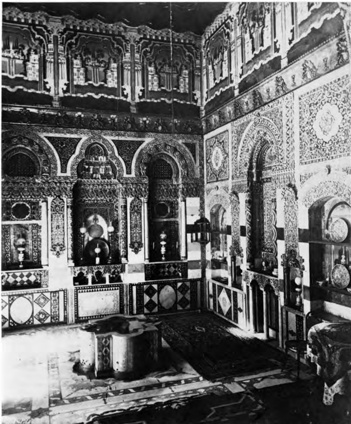
101. Damascus. Interior of the House of the English Consul.