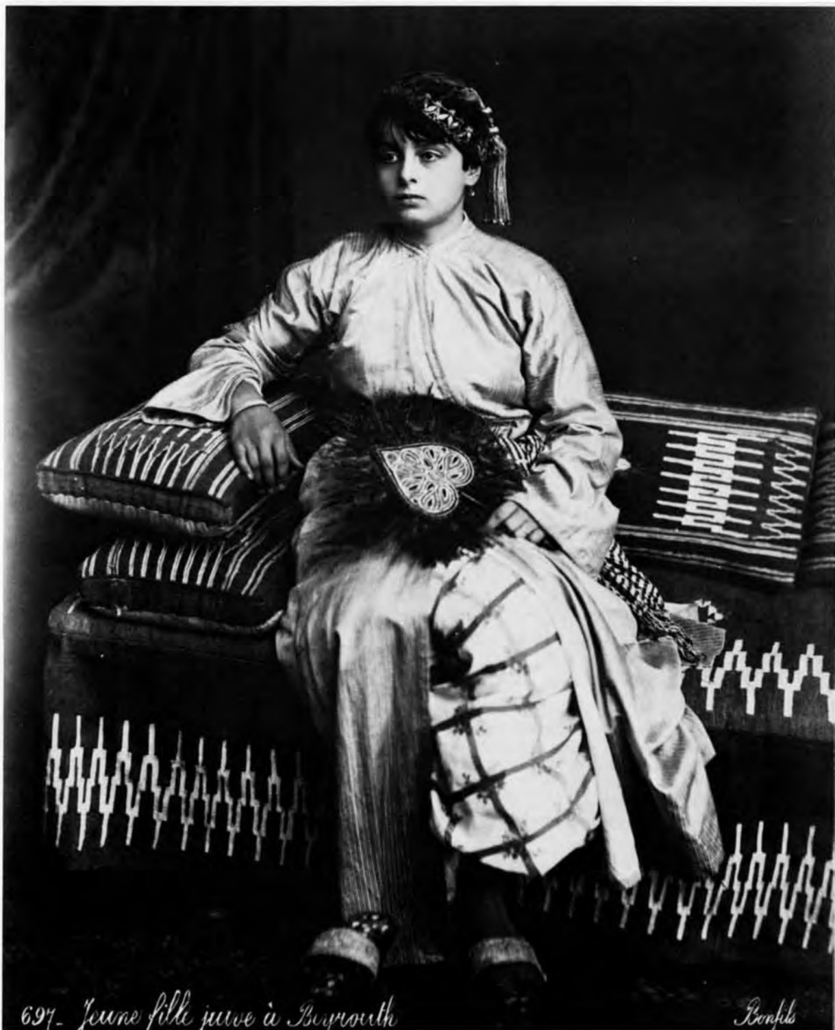
697- Jeune fille juive à Beyrouth