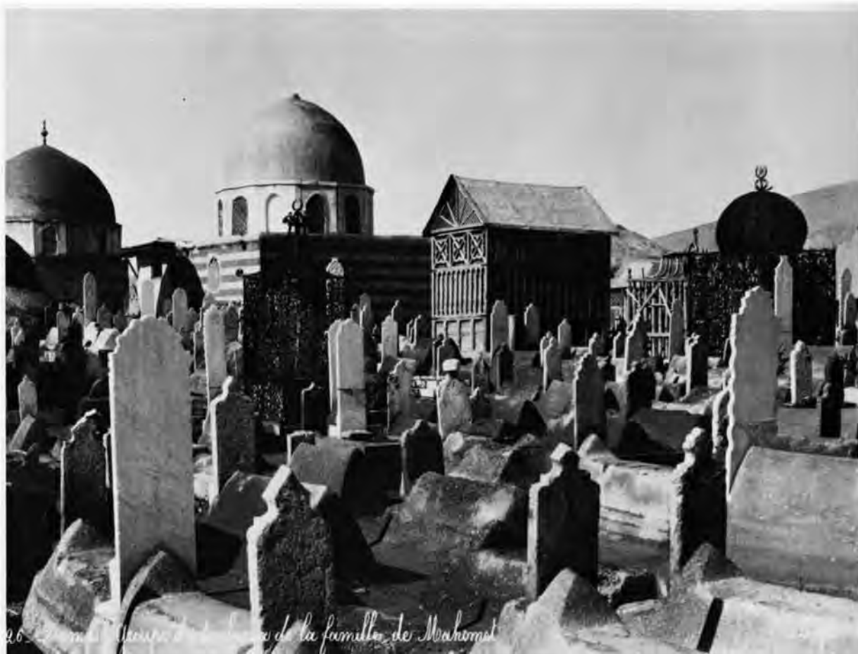
98. Damascus. Group of Tombs of the Family of Muhammad.