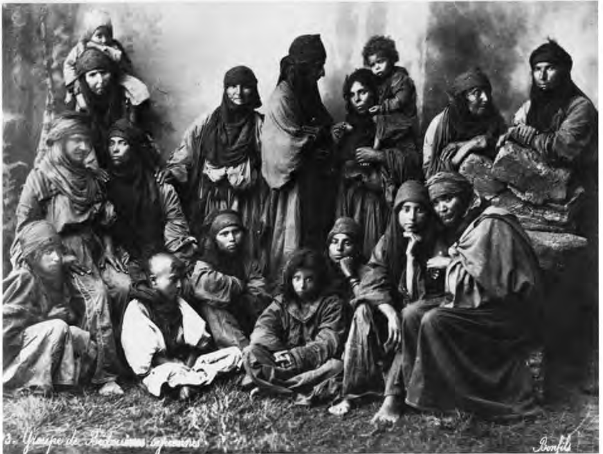
164. Group of Syrian Bedouin Women.