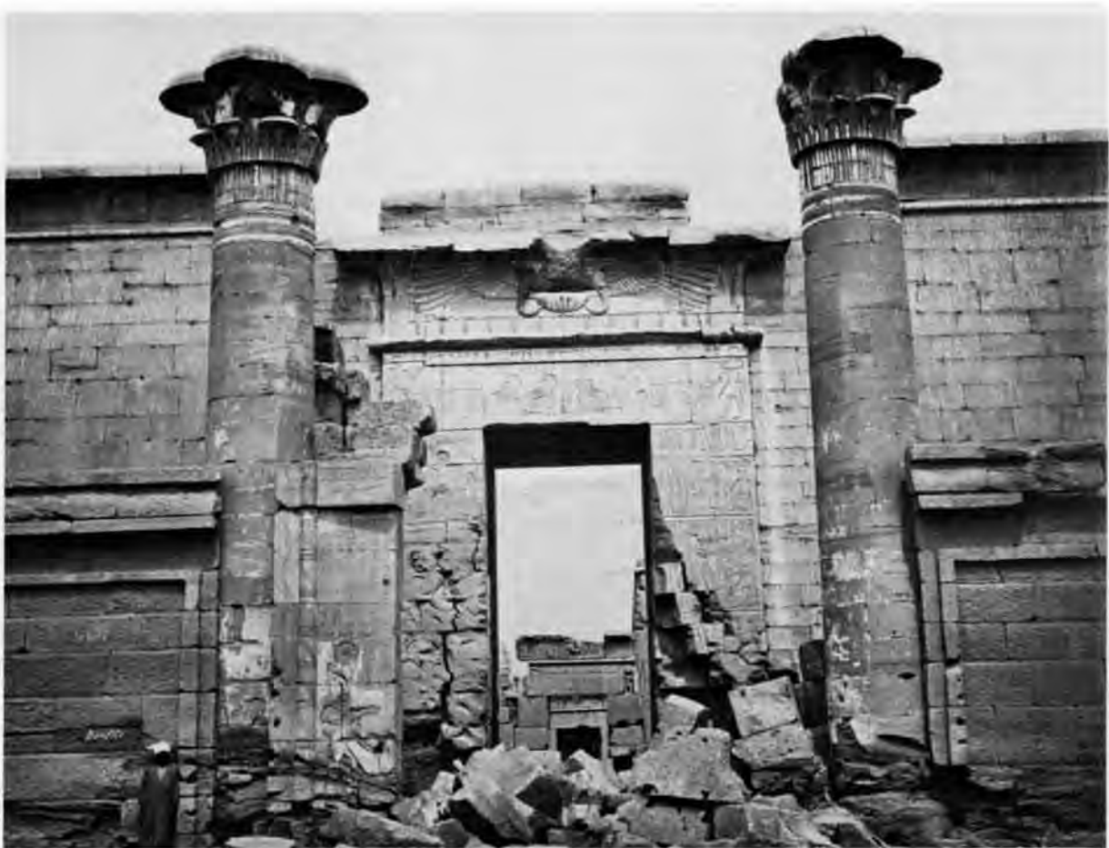
17. Medinet-Habu. General View of the Small Temple, Detail of the Portal (Egypt).