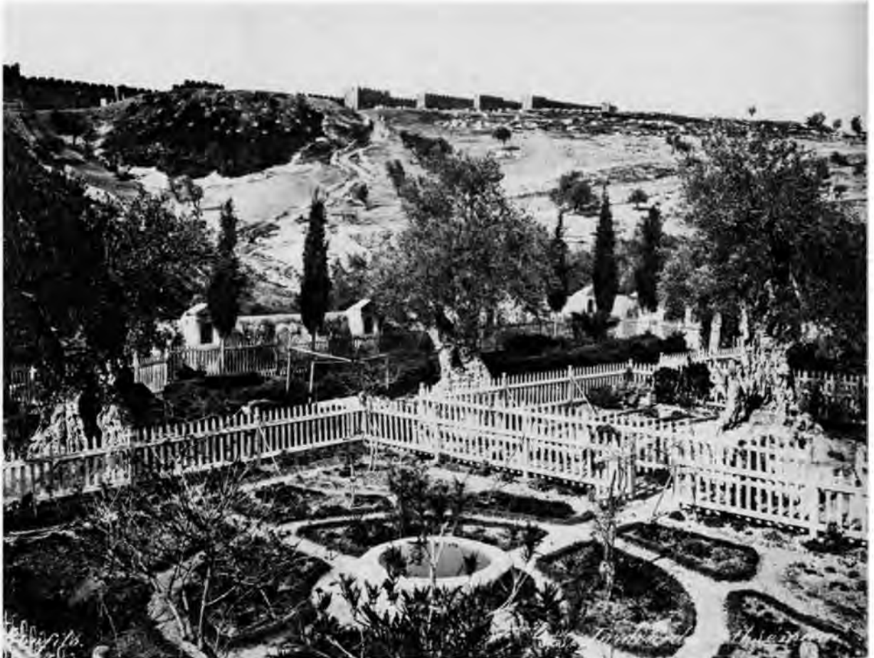
60. Garden of Gethsemane. Collection of the Harvard Semitic Museum.